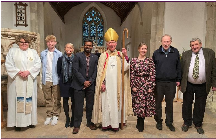
Confirmation Service - April 2023

Our summer series of services in 2023 focused on 1 Thessalonians and its message to us as a church today to rejoice always, pray continually and give thanks in all circumstances. At harvest time the church was beautifully decorated, and we celebrated all God's goodness to us in our Sunday services.