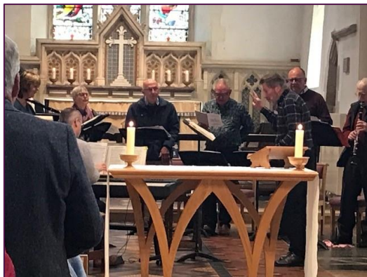
The Music Group in Action at a 10.45am Service