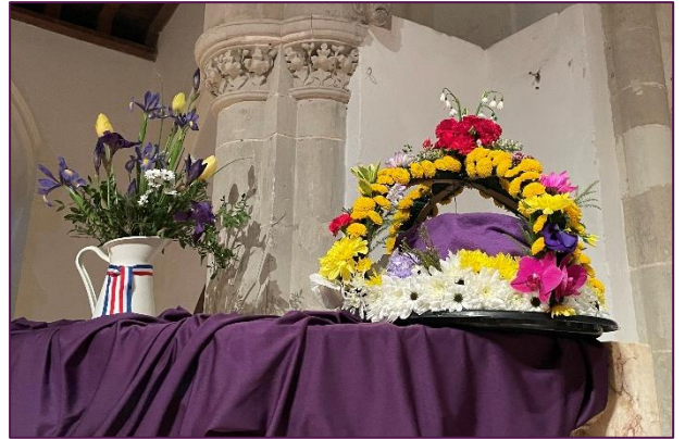
Pulpit Decorations for the Coronation